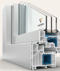
aluminum cover available